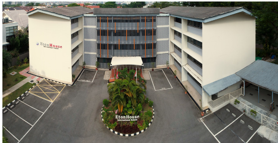
The first EtonHouse campus, on Broadrick Road.